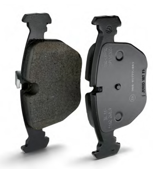
Only Original BMW Brake Pads guarantee optimum interplay with the brake system – for maximum driving comfort without disturbing noises.

To meet the high BMW quality standards, Original BMW Brake Pads have to undergo the toughest practical tests and computer simulations – even after the start of serial production.